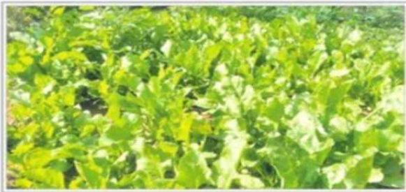
వల్లభాపూర్ ప్రాథమిక పాఠశాల అవరణలో పెంచుతున్న పొలకూర

పేంజులపల్లి (కూకట్ల): కొండడు పెరిటిలోట్లలో కూరగాయల సాగుచేస్తూ ప్రత్యేకతను రాలుతుంటారు. మరికొందరు సింథెటిక్ ఎరువులతో కూరగాయల సాగు చేస్తుంటారు. ఇంకొందరు ఇంటి నడుమనే భూమిలోనే కూరగాయల మొక్కలను పెంచుతుంటారు. అయితే వల్లభాపూర్ ప్రాథమిక పాఠశాలలో పెరగా కూరగాయల సాగుతో కలుపుకు ప్రత్యేకతను రాలుతుంటున్నారని ఉపాధ్యక్షులు విద్యార్థులు. అంతేకాదు పాఠశాలలో ఉన్న స్టాల్ లలో కూరగాయలను పెంచేది వాటిని మధ్యాహ్నం భజానీ ఉపయోగిస్తున్నారు. మండలంలోని వల్లభాపూర్ ప్రాథమిక