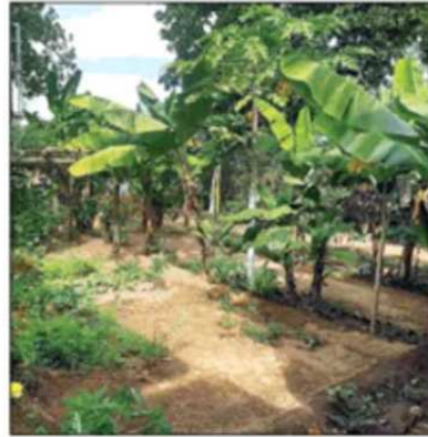
बिलासपुर। स्कूल की नर्सरी में लगाए गए कैले व पपीते के पौधे के साथ हरी सब्जियां।

वसामा मुरमुर के स्कूल भवन और यहां की नर्सरी में रंग बिरंगे फूलों के अलावा फलदार पौधे और हरी सब्जियों की खेती को लेकर ऐसा नहीं लगता कि यह सरकारी स्कूल है। निजी स्कूलों में इतनी व्यवस्थित नर्सरी देखने को नहीं मिलती। यह कमाल यहां पठस्थ