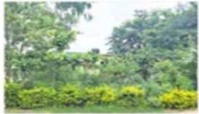
కూరగాయల మొక్కలతో పాఠశాల అవరణ

ఇటీవల సాగుకల్ప విస్తృత వీడుకల్ప ఉత్తమ ఉపాధ్యక్షుడిగా కరీంనగర్ పేరుగా అవార్డు అందుకున్నారు.