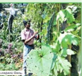
சென்னை மிகப் பெரிய பசுமை தவழும்.