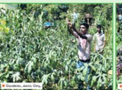
சென்னை மிகப் பெரிய பசுமை தவழும்.

MAGNIFICENT BLOCK IN RAISING KITCHEN GARDEN Vardah major cyclonic storm brought Chennai to a standstill and made landfall and uprooted as many as one lakh and above trees in Chennai alone. The Head Master along with the National Green Corps student's teams planned and have made a giant leap in creating a green revolution in their higher secondary school located in MMDA colony MGR Street, Arumbakkam Chennai. This team along with the school watchman, who is basically a farmer executed this plan, planted paddy and various other vegetable producing plants and have successfully, produced different kind of vegetables. These are being utilized in the MDM and also gifted to the students. The Head Masters from other schools in Chennai have been insisted to visit this school by the Chief Educational Officer. "GARDENERS, DREAM BIGGER, THAN EMPERORS"