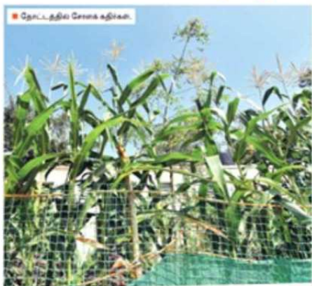
— நமது திரபு — ‘வந்த’ புதுக்கு ரே, பசுமையை இத்து தவிகும் சென்னை மிகப் பெரிய பசுமை தவழும் அரசு பள்ளி, சென்னை, அரும்பாக்கத்தில் உள்ள, அது பள்ளி மாணவர்கள், சிறுமை படைத்துள்ளனர்.

சென்னை மிகப் பெரிய பசுமை தவழும் அரசு பள்ளி • காய்கறி தோட்டத்தில் மாணவர்கள் அசத்தல்