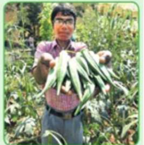
காய்கறி தோட்டத்தில் விளைந்த வெங்காயம், அரும்பாக்கத்தில் உள்ள, அது பள்ளி மாணவர்கள், சிறுமை படைத்துள்ளனர்.

மணவளி குழுவை சென்னை மிகப் பெரிய பசுமை தவழும் அரசு பள்ளி, சென்னை, அரும்பாக்கத்தில் உள்ள, அது பள்ளி மாணவர்கள், சிறுமை படைத்துள்ளனர். மணவளி குழுவை சென்னை மிகப் பெரிய பசுமை தவழும் அரசு பள்ளி, சென்னை, அரும்பாக்கத்தில் உள்ள, அது பள்ளி மாணவர்கள், சிறுமை படைத்துள்ளனர்.