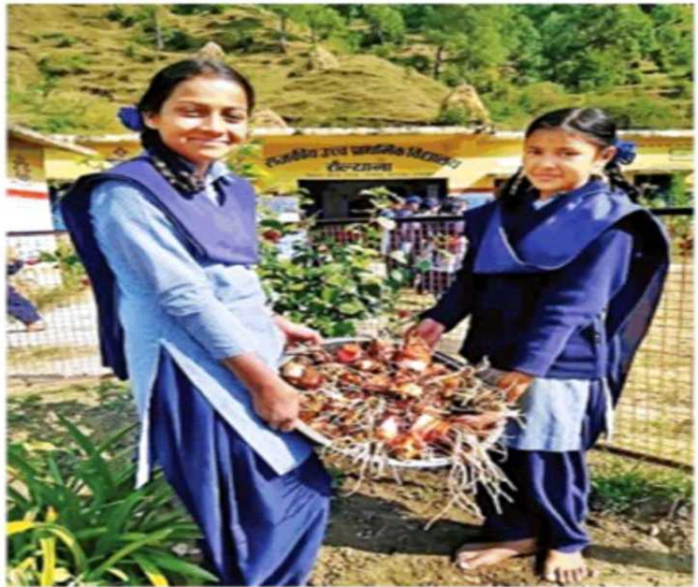
गरुड़ के रोजुहा रौल्याणा में किचन गार्डन की गडेरी के साथ बच्चे