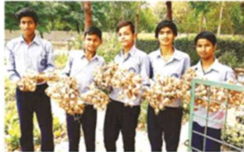
चंडीगढ़: गवर्नमेंट मॉडल सीनियर सेकेंडरी स्कूल सेक्टर-47 में ऑर्गेनिक गार्डन में उगाए गए प्याज और आलू दिखाते छात्र

तब करते हैं। स्कूल में ऑर्गेनिक खेती की शुरुआत प्याज से की गई थी। जो कि बाद में आलू, कद्दू, धनिया, बैंगन, गाजर, मूली, फलक जैसी सब्जियों के रूप में आगे बढ़ती चली गई। इस साल गर्मियों में स्कूल ने दो क्विंटल प्याज पैदा किया। प्याज के अलावा अन्य सब्जियों