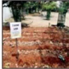
Over 2,500 schools in the state already have their kitchen garden

The schools that do not have land available can raise a terrace garden and use