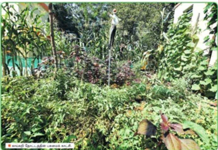
காய்கறி தோட்டத்தில் பசுமை தவழும்.

சு. தீ. சாரம் ஆங்கிலேயர், “வந்த” புதுமை, சென்னை மிகப் பெரிய பசுமை தவழும் அரசு பள்ளி, சென்னை, அரும்பாக்கத்தில் உள்ள, அது பள்ளி மாணவர்கள், சிறுமை படைத்துள்ளனர். புதுமை, தகவல் பசுமை தோட்டம் பற்றியான தகவல்கள், சென்னை மிகப் பெரிய பசுமை தவழும் அரசு பள்ளி, சென்னை, அரும்பாக்கத்தில் உள்ள, அது பள்ளி மாணவர்கள், சிறுமை படைத்துள்ளனர்.