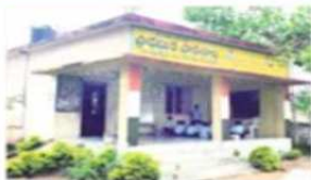
వల్లభాపూర్ ప్రాథమిక పాఠశాల

పేంజులపల్లి (కూకట్ల): కొండడు పెరిటిలోట్లలో కూరగాయల సాగుచేస్తూ ప్రత్యేకతను రాలుతుంటారు. మరికొందరు సింథెటిక్ ఎరువులతో కూరగాయల సాగు చేస్తుంటారు. ఇంకొందరు ఇంటి నడుమనే భూమిలోనే కూరగాయల మొక్కలను పెంచుతుంటారు. అయితే వల్లభాపూర్ ప్రాథమిక పాఠశాలలో పెరగా కూరగాయల సాగుతో కలుపుకు ప్రత్యేకతను రాలుతుంటున్నారని ఉపాధ్యక్షులు విద్యార్థులు. అంతేకాదు పాఠశాలలో ఉన్న స్టాల్ లలో కూరగాయలను పెంచేది వాటిని మధ్యాహ్నం భజానీ ఉపయోగిస్తున్నారు. మండలంలోని వల్లభాపూర్ ప్రాథమిక